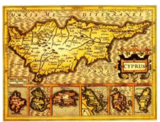
Map of Cyprus (G. Mercator, J. Hondius), 1607

The last two conquerors of Cyprus were the Ottoman Turks, from the 16th to the 19th century, and subsequently the British until 1960. All geographical names, which survived through the centuries, in writing or in oral tradition until 1960, which was the year of the independence of the Republic of Cyprus, are fully acknowledged and preserved by the Government. Many of them have been collected from texts, historical documents, left by the British and the Ottoman Turks and other previous conquerors. All the conquerors of Cyprus imposed their own systems, but never proceeded to massive changes of the traditional geographical names. Following the tragic events of 1974, a significant number of geographical names were completely changed in the northern part of Cyprus. This issue is pending and it is carefully attended by the Republic of Cyprus. It must be noted that all official geographical names of Cyprus include Greek, Turkish and other names that pre-existed 1974 for several hundreds of years. All official geographical names of Cyprus are included in the Toponymic Gazetteer (please see par. 5 below).