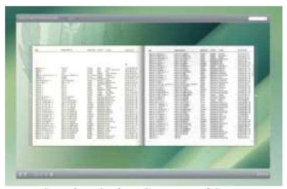
Complete On-line Gazetteer of Cyprus

All geographical names and toponyms included in these gazetteers were derived from the official large scale cadastral map series of the Department of Lands and Surveys. The Complete Gazetteer of Cyprus was digitized, and is currently available on CPCSGN's website (www.geonoma.gov.cy).