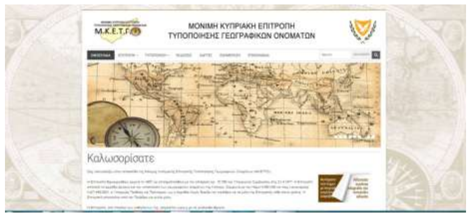
CPCSGN's website (www.geonoma.gov.cy)

All geographical names and toponyms included in these gazetteers were derived from the official large scale cadastral map series of the Department of Lands and Surveys. The Complete Gazetteer of Cyprus was digitized, and is currently available on CPCSGN's website (www.geonoma.gov.cy).